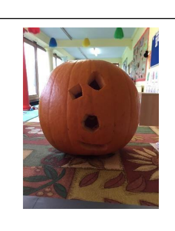
Our 'happy' pumpkin!