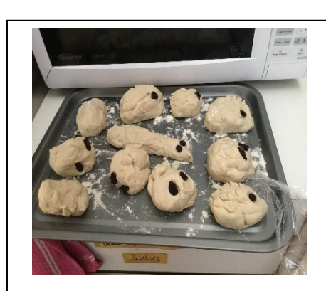
Our 'hedgehog' bread rolls ready for baking!